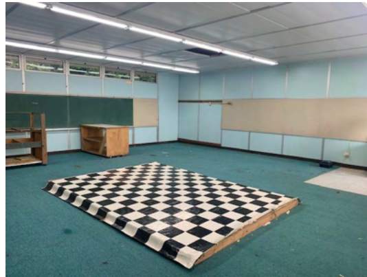
Yes, this is Ladera Linda...empty!!!