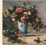
Table Designs Inspired By World Famous Artists From Abstracts To Impressions

$50 advance tickets, $55 at the door Walk-Ins Are Welcome!