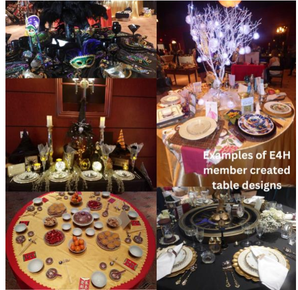
Examples of E4H member created table designs