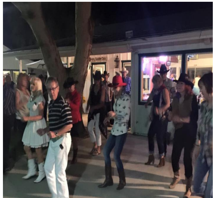
Line Dancing at 2014's Boots, Burlap, and Bandanas Empty Saddle Club