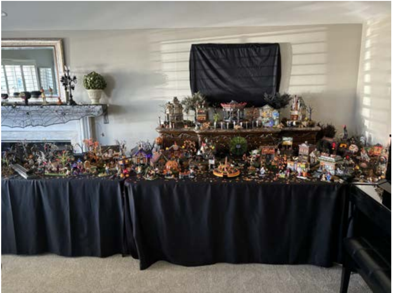
Stella's Halloween Village! You have to see it to believe it!