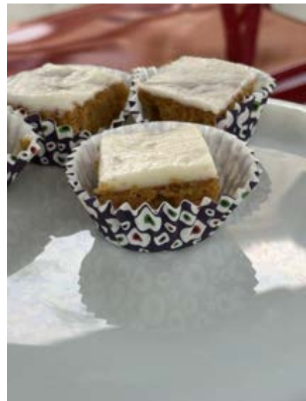
Stella's Pumpkin Squares were so good they deserve mentioning