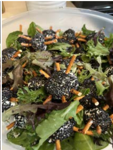
Lorri's Spider masterpiece