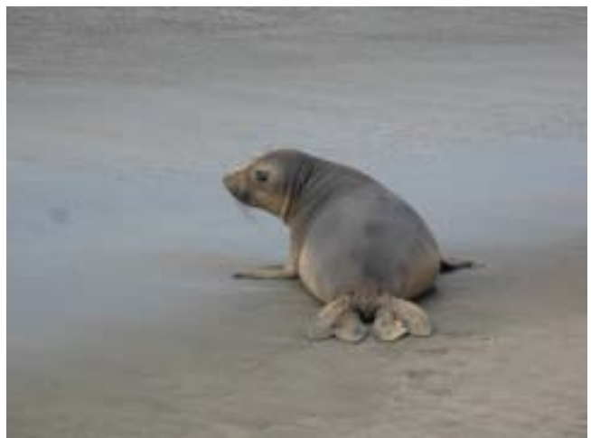
Great member turnout for the elephant seal release! Devotion, named in our honor, was a little reluctant to return home...